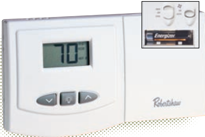
Front Loading Battery Door (9400 Model)

When you select a Robertshaw thermostat, you've made the choice of an industry partner that's been making quality products for 100 years. Come home to affordable comfort. Come home to Robertshaw SM .