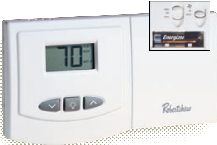
Front Loading Battery Door

When you select a Robertshaw thermostat, you've made the choice of an industry partner that's been making quality products for 100 years. Come home to affordable comfort. Come home to Robertshaw SM .